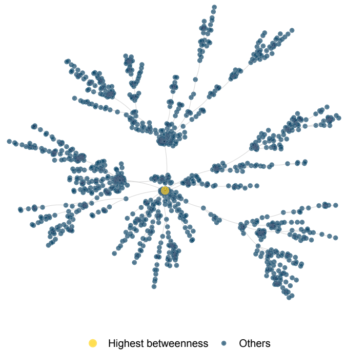
Fig. 1. Example of a preferential attachment network generated with the Barabási-Albert algorithm (30) with 1,000 nodes, one edge per node, and an exponent of 1. We focus on this network as relatively favorable to opinion leadership but in Fig. 3 and SI Appendix show other networks. The yellow node is the highest betweenness node used to test the effect of influentials.

Our control condition seeds the innovation with a randomly chosen person in the network. Our treatment condition seeds the innovation with the most central person in the network, as measured by betweenness. In most networks, betweenness is right-skewed so in our networks the most central node is anywhere from six to several hundred SDs above the mean. # We test the effects on preferential attachment networks (shown in Fig. 1) and small world networks generated in igraph (27) as well as the giant components of the Democratic National Committee email network (548 nodes and 2,442 edges), Enron email network (33,696 nodes and 180,811 edges), and a network of retweets and mentions on Twitter (532,325 nodes and 694,606 edges). We focus on preferential attachment networks in Figs. 1 and 2 but show robustness of our key finding to all these networks in Fig. 3 and SI Appendix .