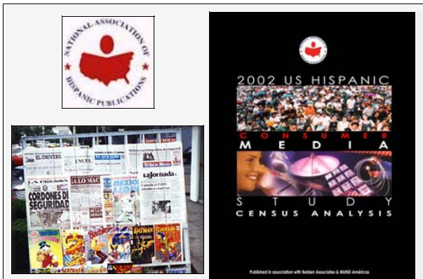
The consumer and media study features interviews with 3,535 Hispanics in Spanish and English in 12 major market areas.

The "2002 US Hispanic Consumer & Media Study" was conducted by the NAHP in partnership with Belden Associates and MUND Américas. It focuses on three areas: a Hispanic consumer profile, a survey of Hispanic media usage and an analysis of the U.S. Cen-